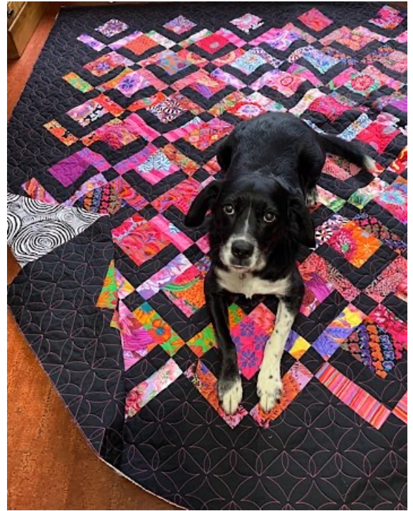
Jake likes to check out quilts while in process.