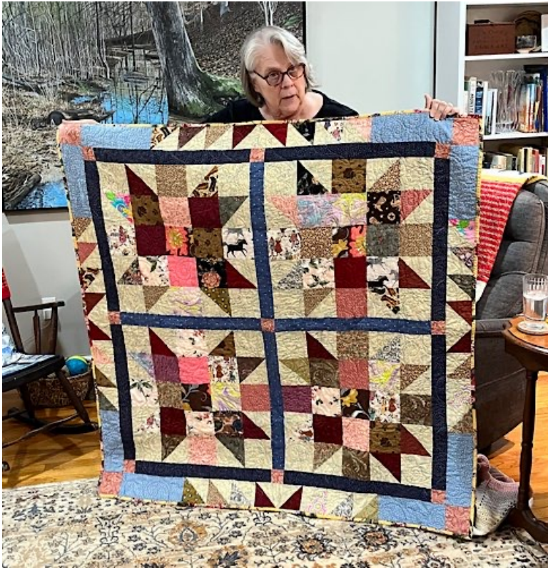
Mary used squares from the Charity Bee stash to create this star designed top