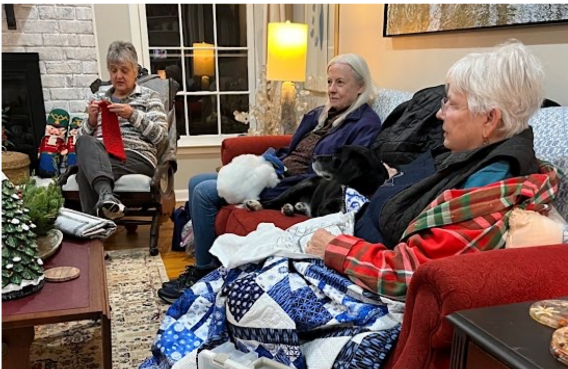
If you look carefully, you'll notice Jake on the sofa, in training as a quilter's therapy dog.